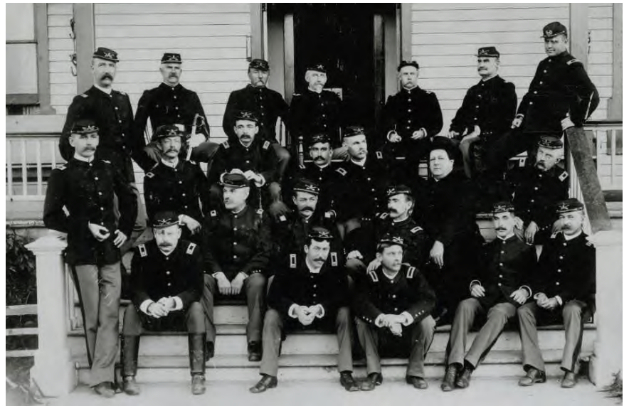
Above: Officers of the 8th Cavalry in Fort Meade, S.D. in 1892.