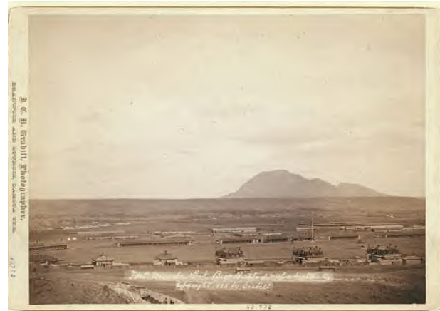
Right: A photograph of Fort Meade with Bear Butte in the distance.

Lamont ordered that the Star Spangled Banner be played during evening retreats across the nation.