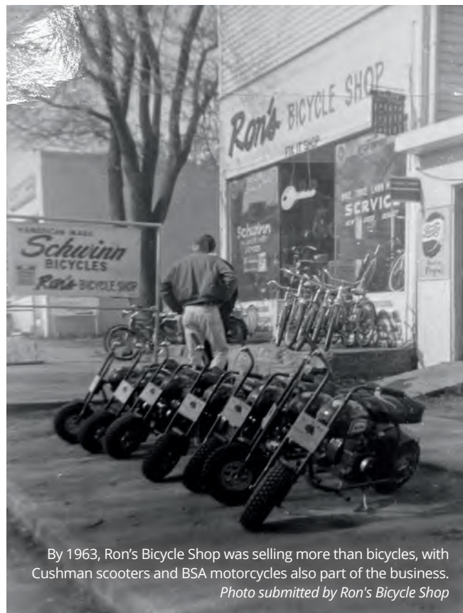
By 1963, Ron's Bicycle Shop was selling more than bicycles, with Cushman scooters and BSA motorcycles also part of the business.