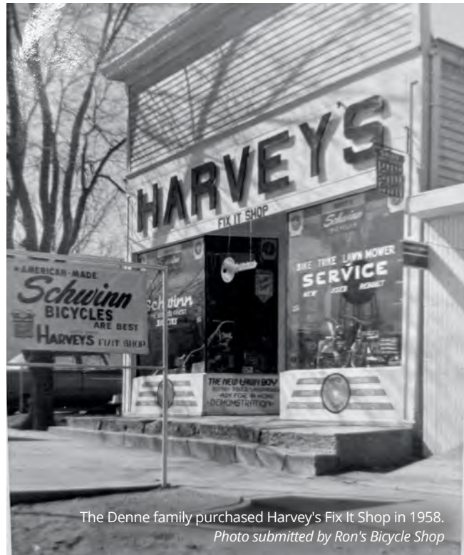
The Denne family purchased Harvey's Fix It Shop in 1958.

Only now, more of those bikes plug in before they hit the trail.