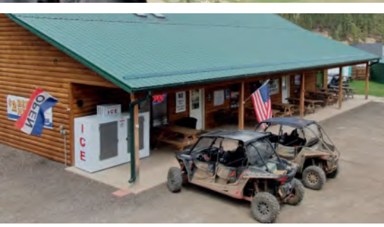
Many ATV trails across the state have access to fishing, scenic vistas and places to pull over for refreshments such as the Merchantile store in Nemo shown above.

as well as multi-day and seasonal passes. Camp sites are available at a rate of $20 per night with electricity and $10 without.