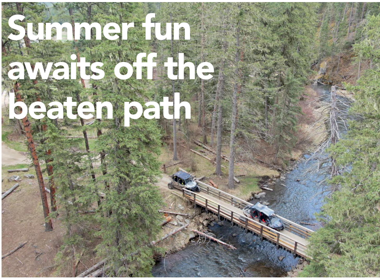
Off-road enthusiasts from far and wide come to ride the Black Hills.