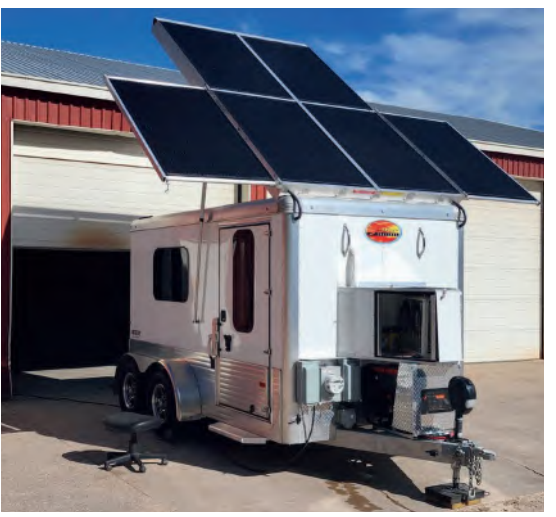
Solar demonstration trailer.