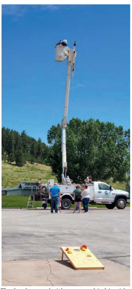
The bucket truck rides were a big hit with kids AND adults!

We appreciate everyone coming out to show your support for your local electric cooperative. We're looking forward to seeing everyone again next year!